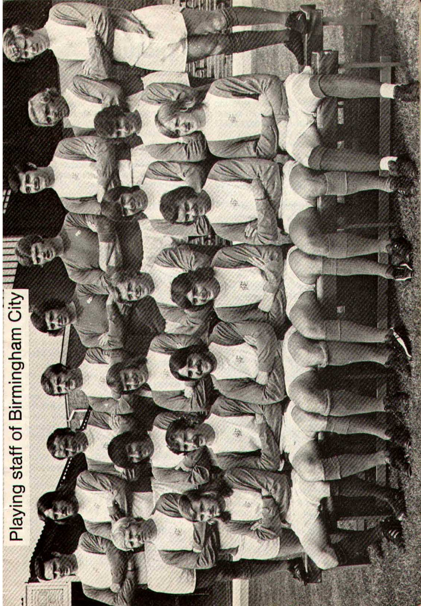
Playing staff of Birmingham City